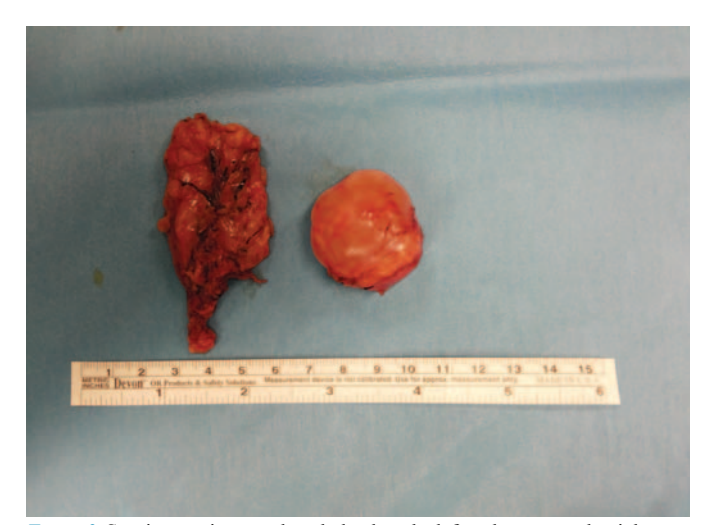
Figure 2. Specimens picture: adrenal gland on the left and tumor on the right

ated epithelium, mucous glands and cartilage (Fig.s 2,3 and 4).