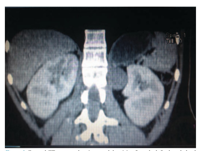
Figure 1. Coronal CT scan cut showing a nodule arising from the left adrenal gland

A 28-year-old female with known diabetes mellitus type 1 presented with a left dorso-lumbar pain for a few months, a mild hypertension and a difficult diabetic control. Abdominal ultrasound revealed a 3 cm nodular formation, apparently on the left adrenal gland. Abdominal computed tomography (CT) confirmed a nodule arising from the left adrenal gland, well delimited, with 25x38 mm, homogenous, suggestive of an adrenal adenoma (Fig.1).